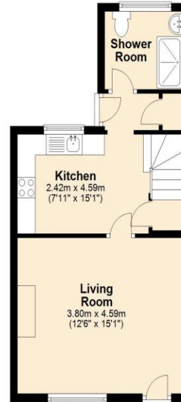
First Floor Approx. 29.0 sq. metres (312.1 sq. feet)